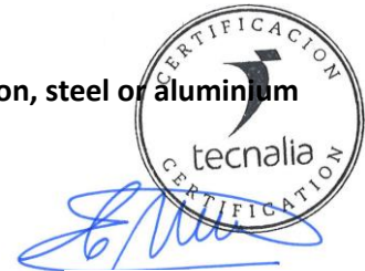
Carlos Nazabal Alsua Manager

Issued date / Fecha de emisión: 26/10/2022 Update date / Fecha de actualización: 26/10/2022 Valid until / Válido hasta: 25/10/2027 Serial Nº / Nº Serie: EPD0760100-E